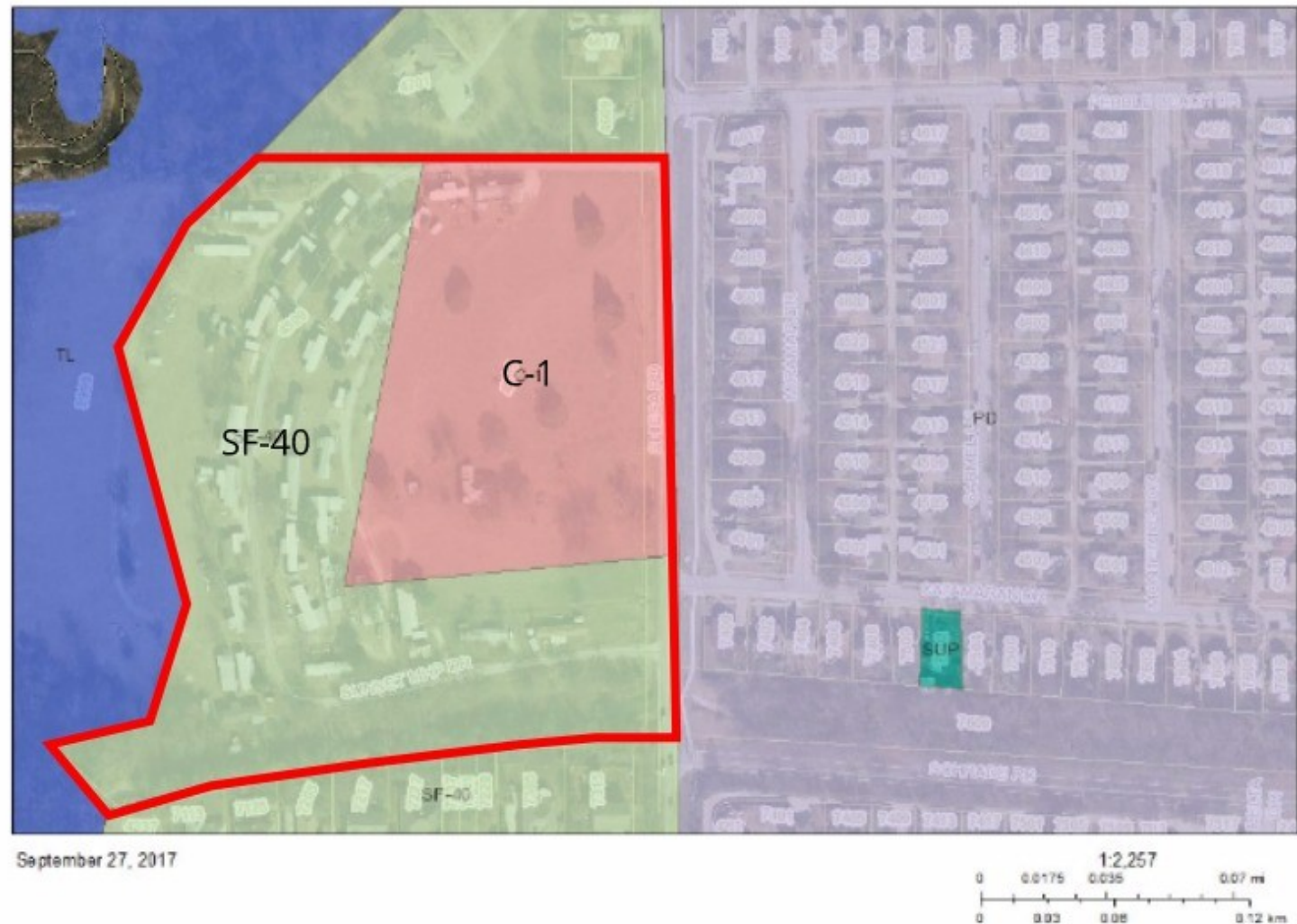
Zoning for 4509 Chiesa