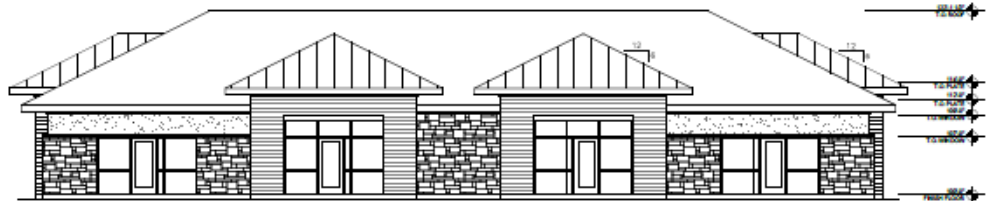
1 FRONT ELEVATION SCALE: 3/16" = 1'-0"

For more information, please contact David English